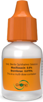
Moxifloxacin/Bromfenac Sterile Ophthalmic Solution

Your doctor has prescribed you the following medication from OSRX